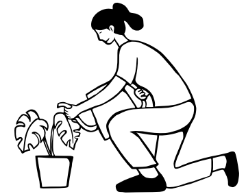
I like to