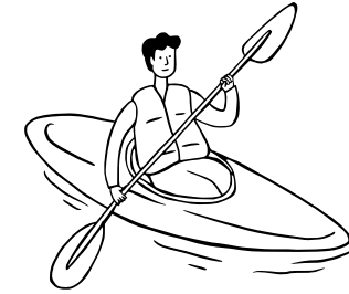
I like to