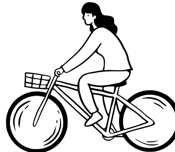
I like to