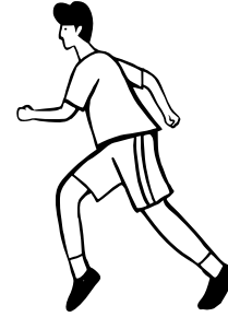
I like to

P K A A A M R Q A P Y L H W T P O L A L S X C K C L S E E X A H V G M Y B L Y E A A H W V I A O P O Q J A E C K M Y A H G Q B T T C S Q B K L M P I V N A A U O N F C I I G I K I N I D R Z E G F F P P R T N N N G N F D P M R O T Y X D V G J G T G I E T A A L N C D W X D O P H A S N Z B P Q R Q S A Z J T E E P H I L Q H E Y E S T A H D Q G I I N D X Y O D Y E C L C X S U C N G I Z C B P F N H R E A D I N G Y C Y T P Z T L I F E V V T I T N V A H A D O I N G Y O G A C S L Y R M F Q C A G W L O D R I Z E B F E