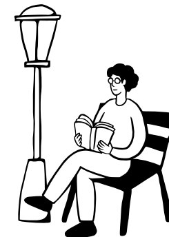
I like to