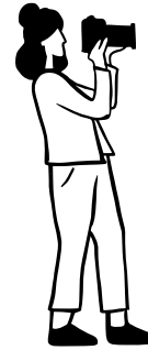
I like to