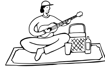
I like to